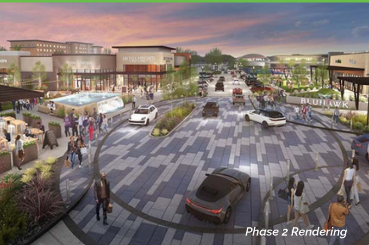
Phase 2 Rendering